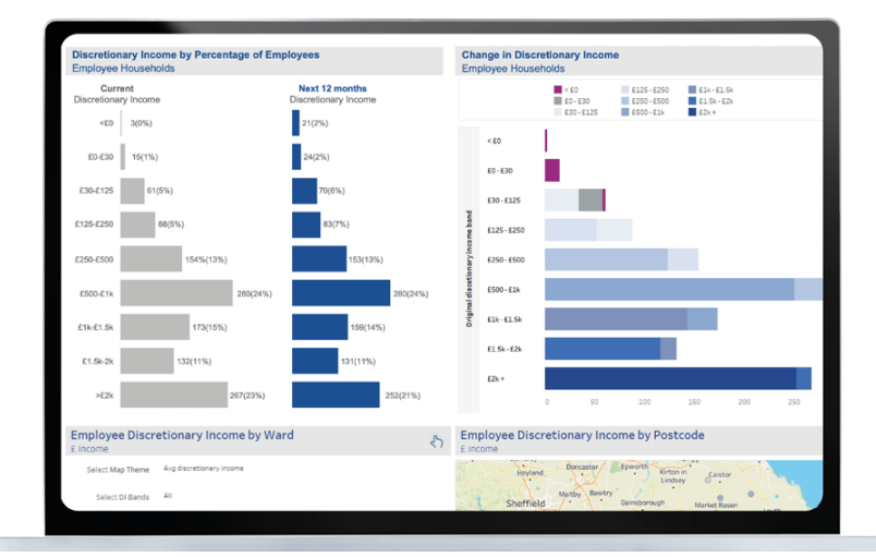
Fig 3 - UK CoL Mosaic / Sector Dashboard