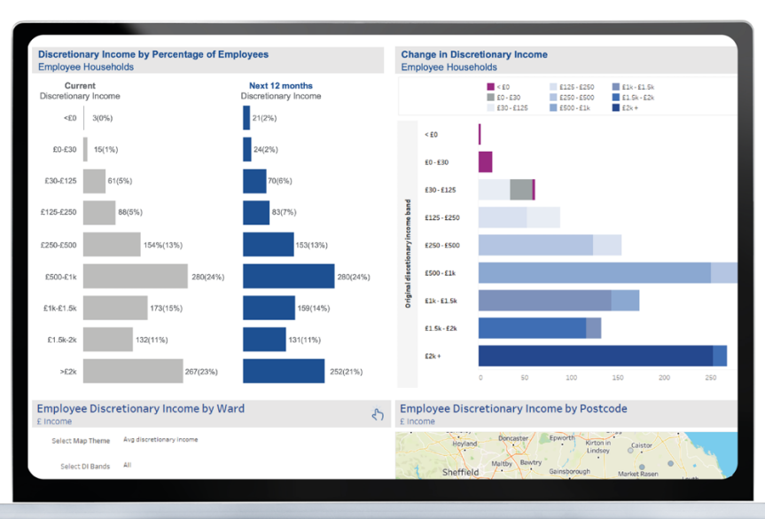
Fig 2- Employee Financial Wellness Dashboard example

To help interpret the results to our analysis, we have provided the insights in an interactive dashboard, which allows an employer to flex each individual segment of essential spend to predict their employees' ability to cope with future rises to energy or food, or transportation costs for example. The dashboard shows the number of employees moving between bands of monthly discretionary income: